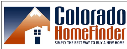
1st Place by Colorado Home Finder

TrailMark's Holiday Lights Contest is sponsored by your neighbors' businesses: