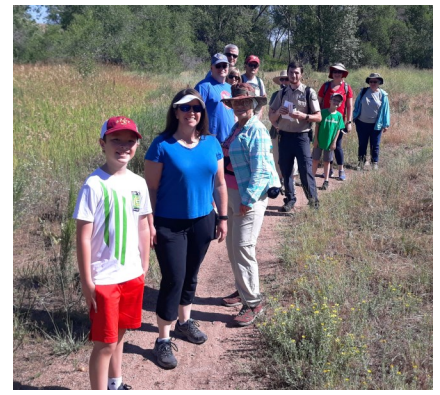
July's ranger-guided hike

Sign up here: https://www.signupgenius.com/go/4090849A4AE2EA4F94-plum