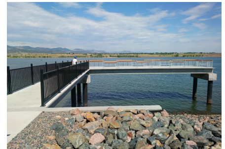
Chatfield Reservoir

FYI: Chatfield State Park is looking better all the time. For those interested in a good bicycle ride, you can access Chatfield on the zig-zag trail across Wadsworth, then proceed south, over bridge to the marina, then past the marina, again to the south-east and you come upon the new dam entry trail. You can then proceed across the dam, down the trail to the swim beach and back to the bottom of the Zig-Zag trail back to TrailMark. It is about 14 miles around the loop. Enjoy!