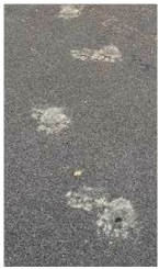
TrailMark photo by Jimmy Dean

Bears are visiting our neighborhood again! Please be vigilant! Keep your garbage cans locked up inside until the morning of garbage day. Repeat “visitors” may have to be put down by the city and we wouldn’t want that!