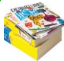
Magazines & Phonebooks