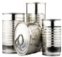
Metal Food Cans