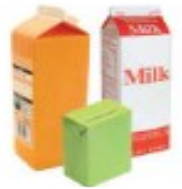
Milk & Juice Cartons & Juice Boxes