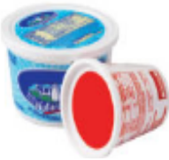
Plastic Tubs #1-7