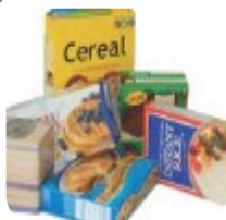
Food & Tissue Boxes Flattened