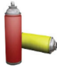
Empty Aerosol Cans