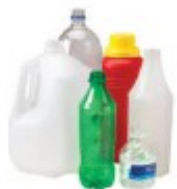
Plastic Bottles & Jugs #1-7