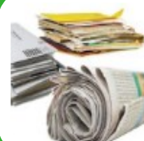
Junk Mail, Mixed Paper, Paper Bags & Newspaper