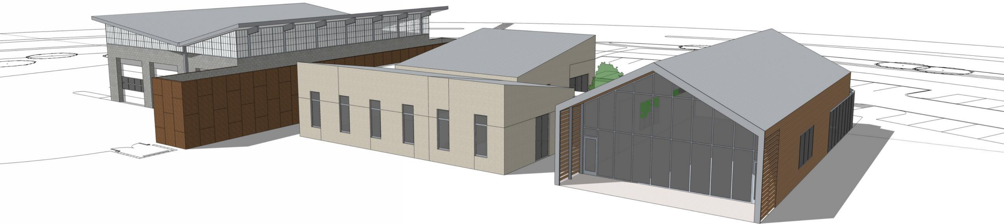
PHASE 2 - VIEW FROM NORTHEAST