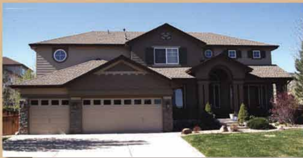
9505 S. Field Way

"Shaker Painting painted our house in March 2011. We wanted to do something a little different, but still stay within the guidelines of the TrailMark HOA. Shaker worked with us on our custom painting. As a result, my house looks perfect! I think the end product we received exceeded the quality I've seen on other paint projects in the neighborhood. I highly recommend Shaker painting."