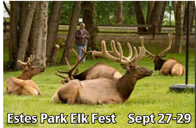
Estes Park Elk Fest Sept 27-29

August 26 - September 5 in Pueblo • coloradostatefair.com