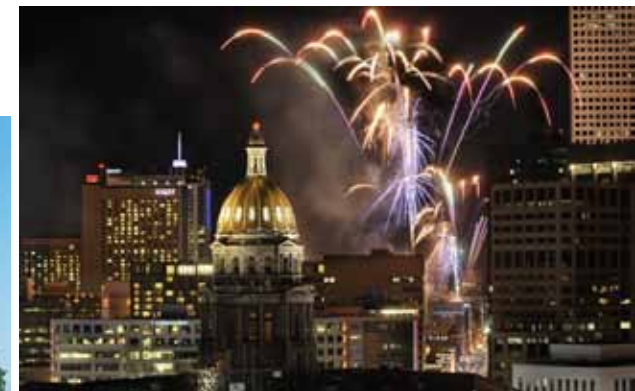
Denver New Years Eve 2016 Parties

https://www.eventbrite.com/d/co--denver/new-years-eve-parties/