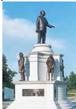
Denver MLK Marade City Park to Civic Center Park 9am