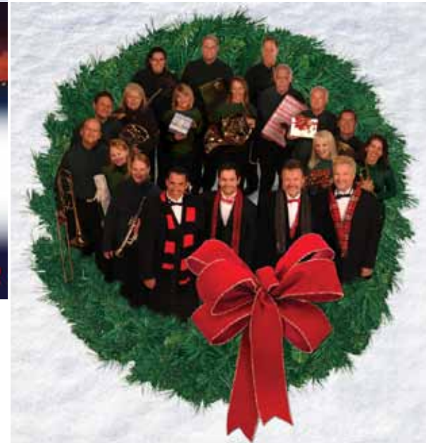
“Feels Like Christmas” Legacy Quartet with The Denver Brass December 19 & 20