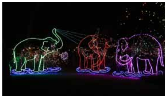
Denver Zoo Lights December 4-January 3 5:30-9pm