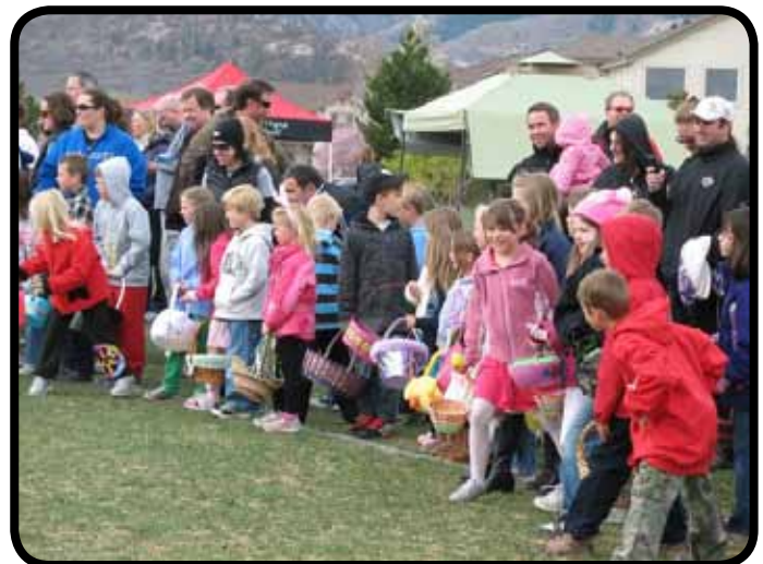
Despite the chilly morning, TrailMark kids and families enjoyed the 2011 Easter Egg Hunt with smiles!

Inform your neighbors about the new TrailMark website and also about the electronic newsletter. It is the only way the HOA can inform our community about upcoming events or news flashes concerning safety within the TrailMark area. Look for us on the web. Place our web address, trailmarkhoa.org as a “favorite” and check it once or twice a month. We are always adding items that may be of interest to your family.