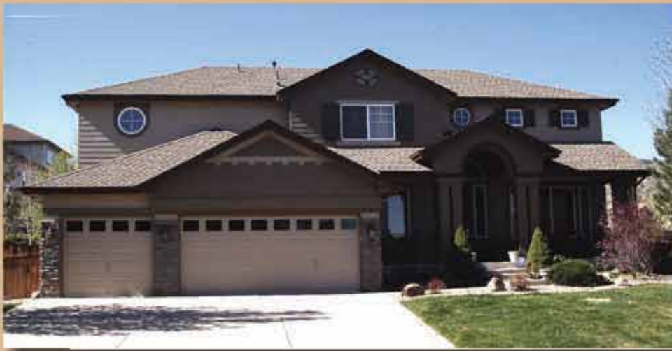
9505 S. Field Way

"Shaker Painting painted our house in March 2011. We wanted to do something a little different, but still stay within the guidelines of the TrailMark HOA. Shaker worked with us on our custom painting. As a result, my house looks perfect! I think the end product we received exceeded the quality I've seen on other paint projects in the neighborhood. I highly recommend Shaker painting."