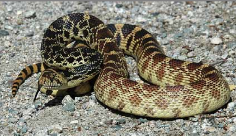
Bull Snake: Good Guy