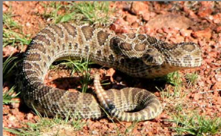
Rattlesnake: Bad Guy