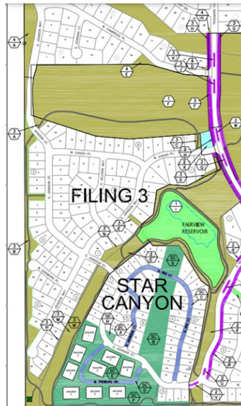
Click on image for enlarged map.

TrailMark is planning to begin painting the split rail fence in Filing 3. This includes the "Filing 3" area on the map, as well as Star Canyon Condos and Patio Homes, and the fencing along the southwest of the neighborhood.