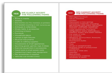
Goodwill Acceptable/Not Acceptable Items