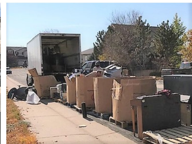
Dumpster/Donation Day 2020