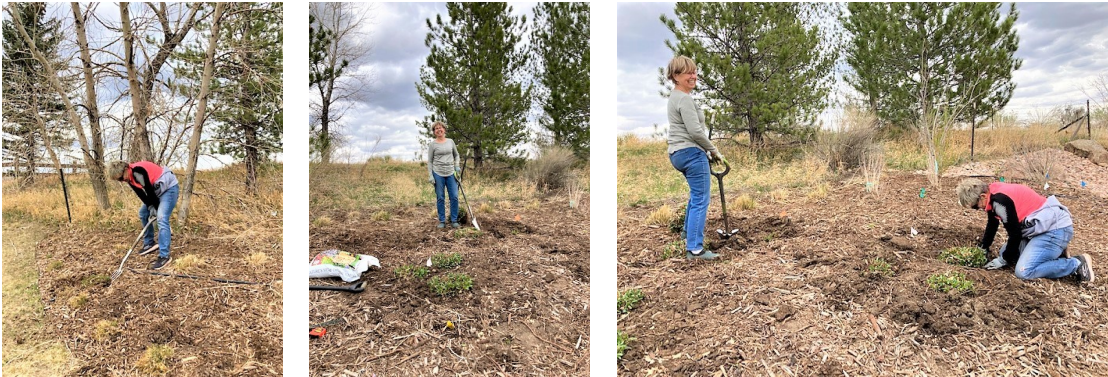
OUR CAC HARD AT WORK

Long term goals include replacing the turf on medians with rock and earmarking shrubs/trees that need replacement within TrailMark property, these will be projects that are executed in phases.