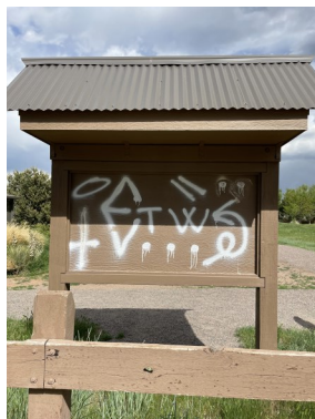
Damaged Hogback Hill Park bulletin board