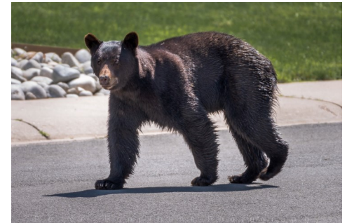
taken with a 500mm lens used for wildlife and shot at a safe distance.

Many of you are aware that a bear or two were out posing for selfies in TrailMark this month. Our Board wanted to alert the community about the severity of the bears visiting our homes. We are including an article from the CDOW on Bearproofing Your Home.