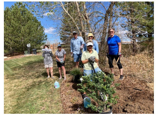
CAC Committee volunteers - May, 2022

* Some of the plants that we wanted to use were sold out by the time we requested them, so we will add a few more this fall or, next spring.