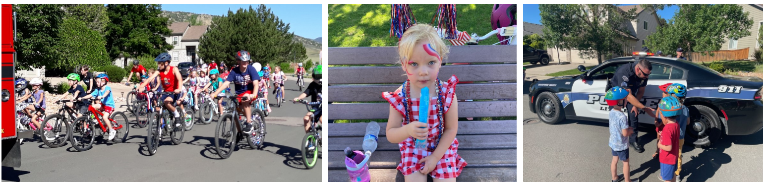
View more 4th of July Bike Parade photos at trailmark.org

Thank you to our Social Committee for decorating the park and setting up the face painters and bouncy houses. It was so fun seeing our neighbors come out and enjoy this festive holiday.