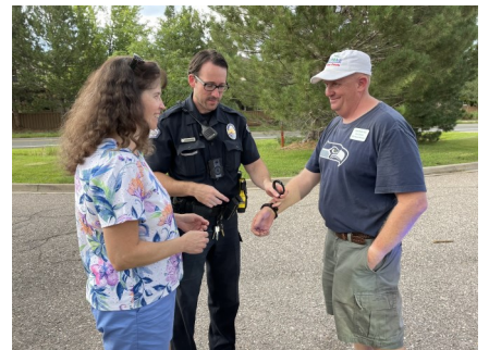
View more photos at trailmark.org.