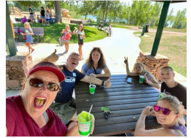
View more photos at trailmark.org.