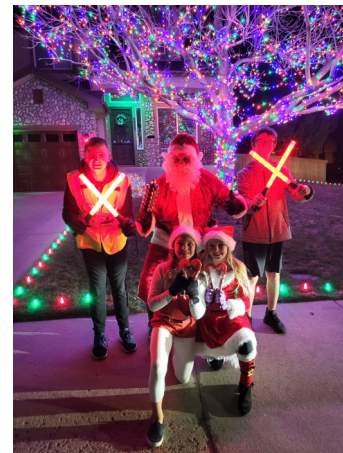
Santa and his helpers