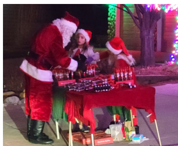
Santa and his helpers