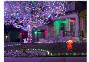
1st Place Residence 2022

Saturday, December 16th (deadline to enter your home is December 14th) 6:30 pm Throughout TrailMark