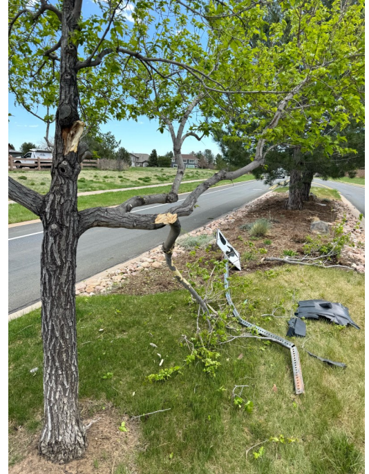
South Holland and TrailMark Pkwy

Police are looking for a 2011-2017 dark colored, possibly black Infinity SUV, either a QX60, or QX80 with significant body damage to the front driver's side (see photos below).