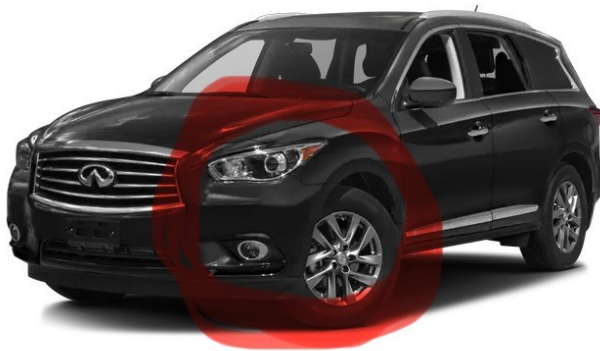
Black Infiniti QX60 with obvious front end body damage