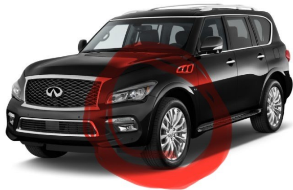
Black Infiniti QX80 with obvious front end body damage